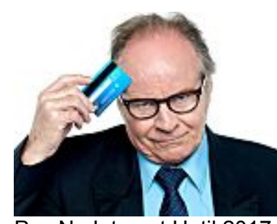
Pay No Interest Until 2017 With These Credit Cards ... (NextAdvisor)