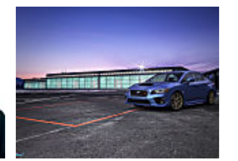
10 Best All-Wheel Drive Vehicles Under 25K (Carophile)